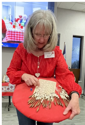
gifts of bobbins from all over the world, but especially the ones made by her father and her husband for her.