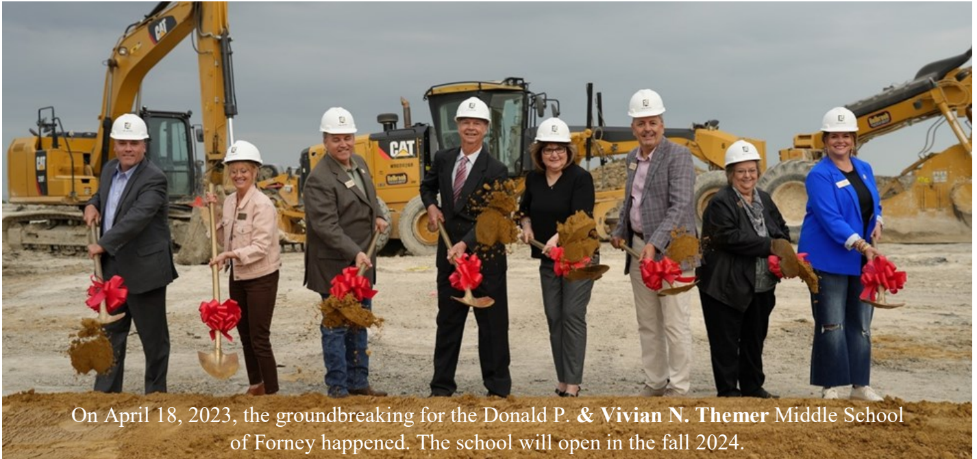
On April 18, 2023, the groundbreaking for the Donald P. & Vivian N. Themer Middle School of Forney happened. The school will open in the fall 2024.